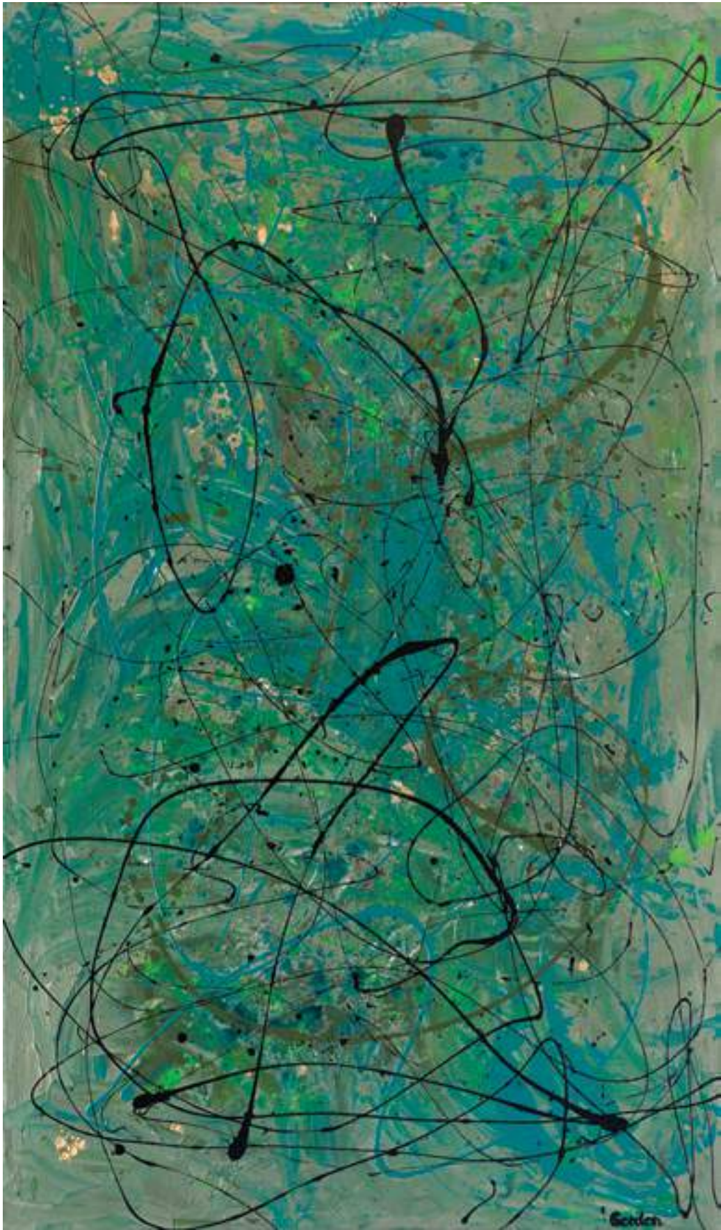
Vortex 7: The Concept Of Desire I | 2010 Vortices: A Discourse Of Bohemian Rhapsodies Acrylics on canvas, spatula technique 170 x 100 cm