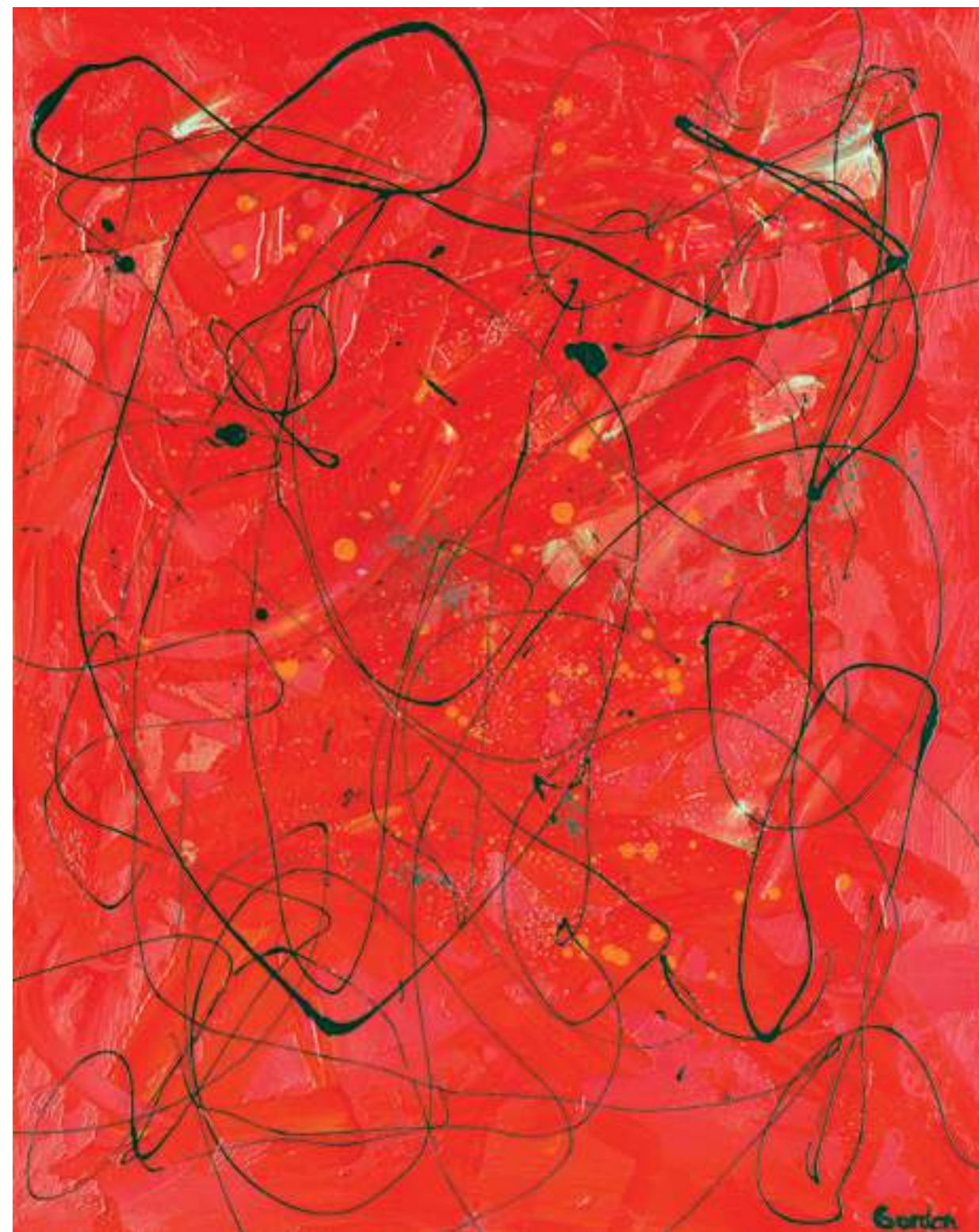
Vortex 16: The Hunt And The Trophy II | 2010

Vortices: A Discourse Of Bohemian Rhapsodies Acrylics on canvas, spatula technique 100 x 80 cm