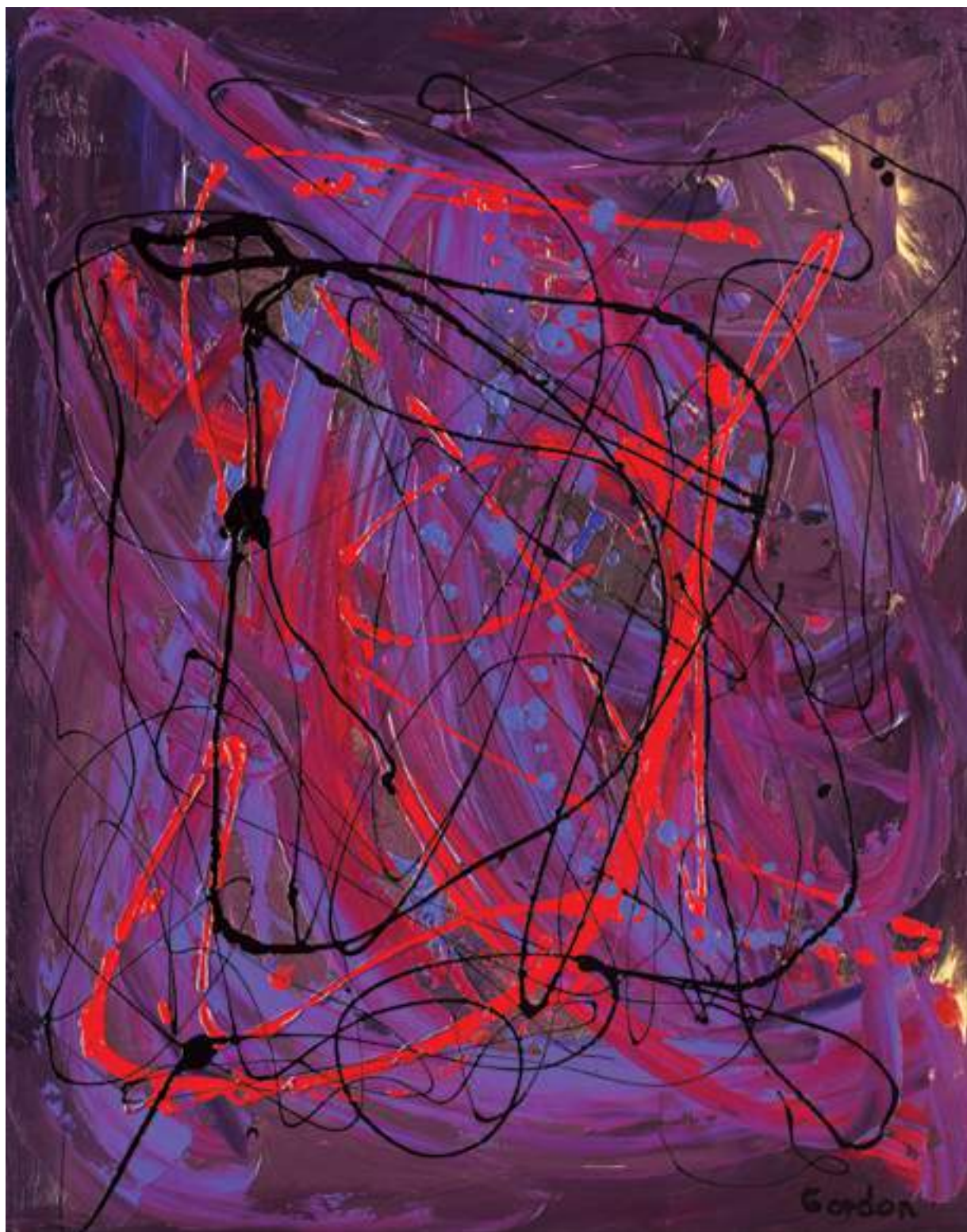
Vortex 13: The Concept Of A Magical Impression I | 2010

Vortices: A Discourse Of Bohemian Rhapsodies Acrylics on canvas, spatula technique 100 x 80 cm